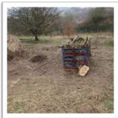
Pictured: Holiday Inn for Bugs and insects

We have had a very exciting start to the year at Forest School! We moved sites in order to rest our previous site and a mini beast mansion has been built by many of our learners which is going to become a home to lots of different species over the next few months. We have also been lucky enough to have some snow on a few of our sessions! Now Spring is around the corner we are looking forward to new adventures and discoveries!