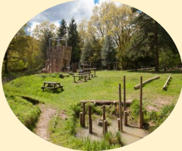
Frank Chapman Centre