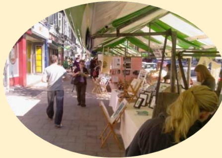
Digbeth Arts Market